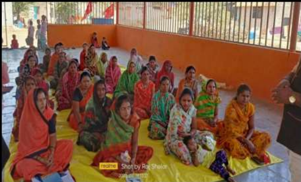
Women from various self-help groups in Chandanpuri village attending the meeting of the Women's Self-Help Group.